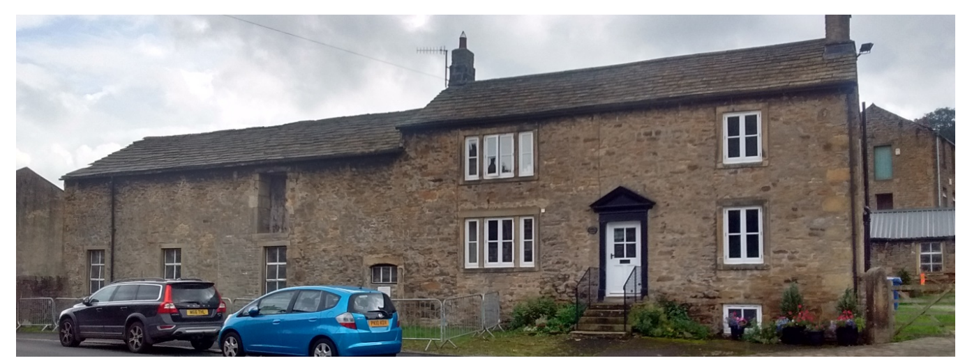
Fig 19 Grundy Farm with listed wall attached; largely unaltered since the nineteenth century