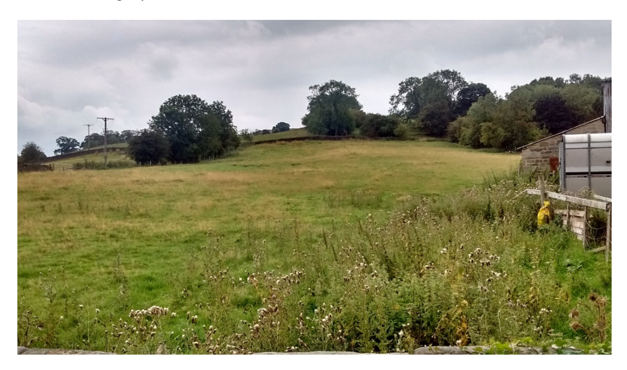
Fig 7 View south across application site from edge of Grundy's Farm yard

6.6 Grundy's Farm and associated curtilage listed structures: these have a direct physical access to the field which constitutes the application site and have a direct functional relationship with the field (Fig 7 below). Although the owner of the listed building does not farm this land the field is let to a tenant farmer who keeps sheep here and who still uses the Grundy's Farm yard to shear the sheep. The income from this tenancy contributes towards the upkeep of the listed buildings whilst the reliance of the farm on the field ensures that the field is managed and maintained. There is a direct and long-standing symbiotic relationship between the listed building and the application site which enhances an understanding and appreciation of the significance of the listed building as an in-village, post-enclosure farm.