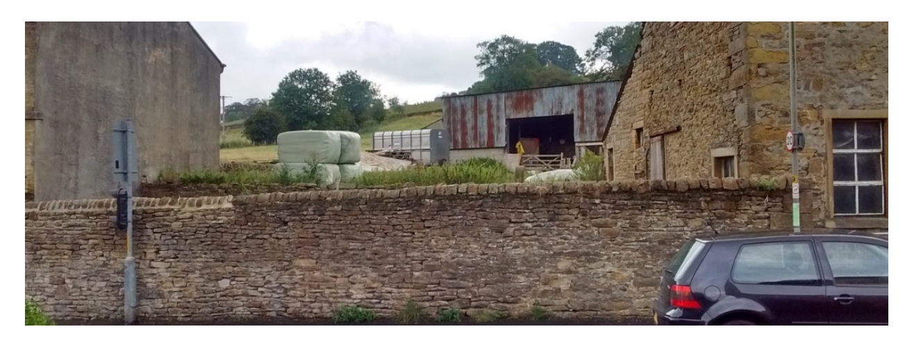
Fig 10 View directly towards listed wall and into application site from 1 & 2 South View

6.10 1 and 2 South View : these face directly into the site (Fig 10 and can be seen from within the site and so have a sensory interrelationship with the site.