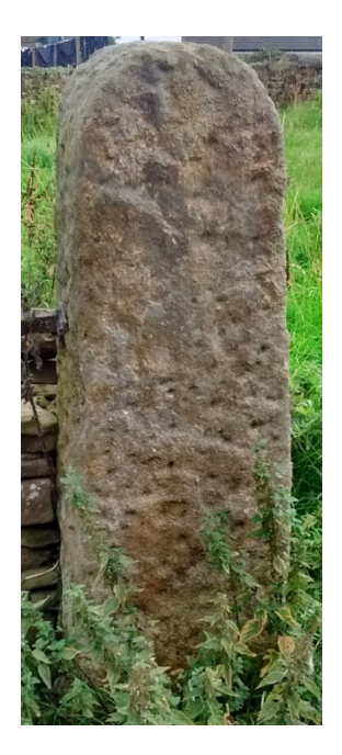
Fig 5 Monolithic gatepost forming part of enclosure to be demolished