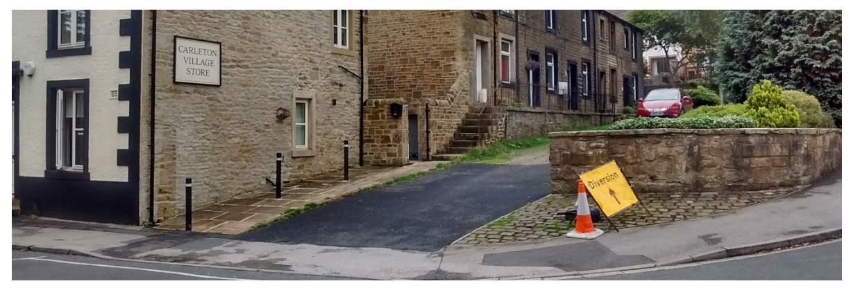
Fig 18 Termination of boundary wall to allow vehicular access weakens streetscape

Substantial stone boundary walls are typical features of the Conservation Area