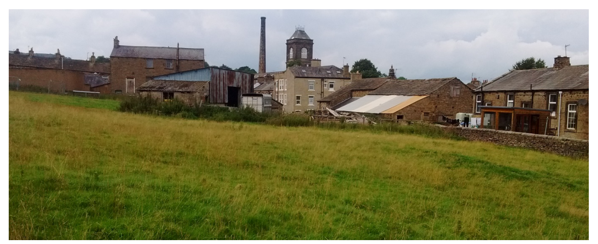
Fig 14 Site forms part of rural setting of Carleton Mill, Grundy Farm, Carleton Conservation Area and former mill (non-designated heritage asset) providing quality views of each asset