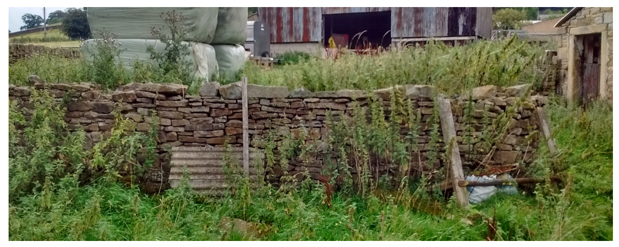
Fig 4 'L' shaped wall forming enclosure to east of Grundy's Farm