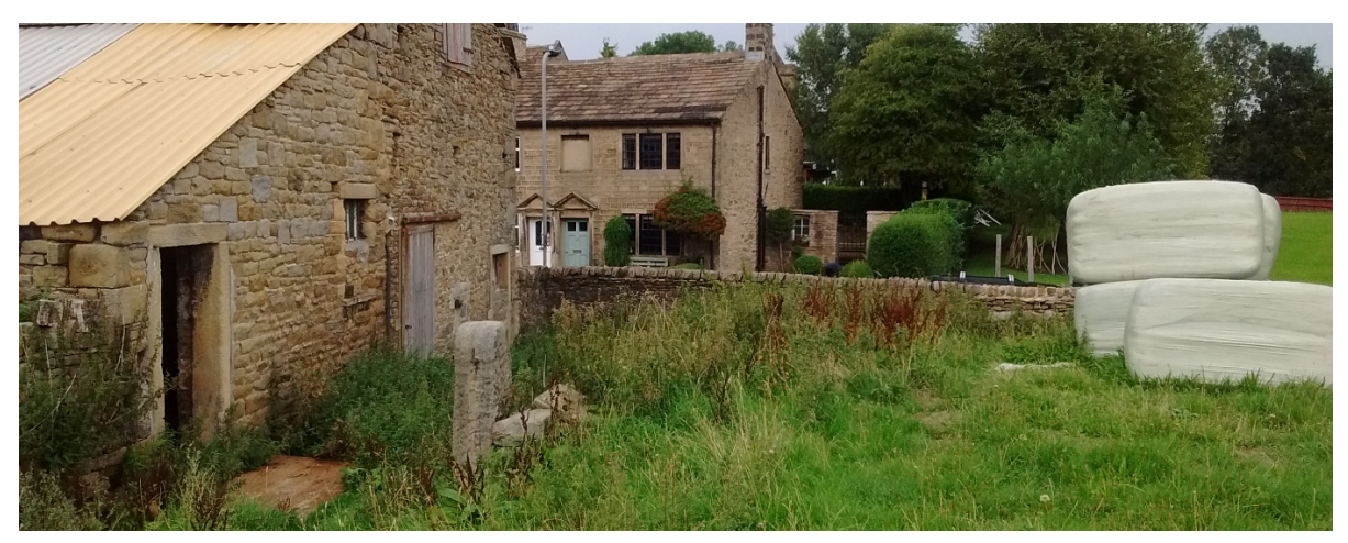
Fig 3 Historic gatepost to enclosure contributes to setting of Grundy's Farm and 1 & 2 South View