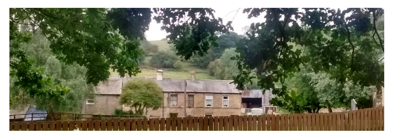
Fig 13 View of application site from Grade II listed St Mary's Church contributes to rural setting

The church is nineteenth century but built on the site of a medieval church which forms part of the building's significance. The significance of the building as a rural church is reinforced by views out of the churchyard towards open countryside including views south towards the application site (Fig 13 below).