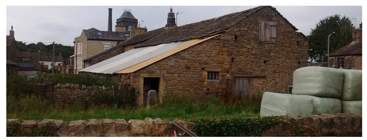
Fig 9 The natural, grassy yard contributes to the rural character and setting of the listed farm