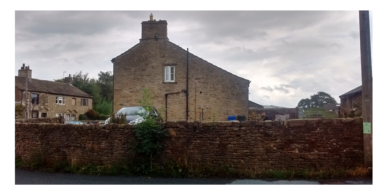
Fig 8Grundy's Farm from west with view towards fields and trees beyond