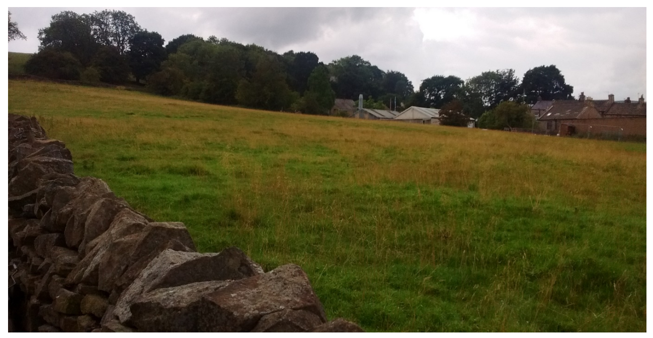
Fig 20 View south-west across application site