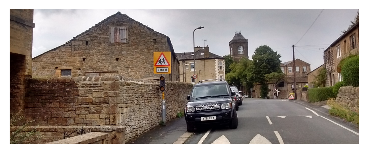
Fig 12 Listed wall creates strong boundary typical of the CA and combines with gable of Grundy's Farm to create a highly attractive streetscape which acts as an historic foil for the mill, Swan Inn and 1 and 2 South View contributing to Group Value and enhancing their setting.